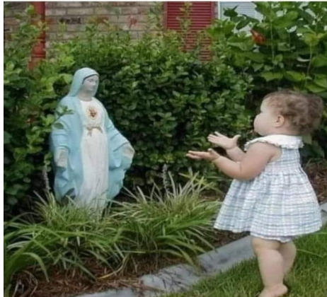
Me explaining "I wanna be good! But I'm gonna probably need the forgiveness package"

ST. MARTIN PARISH , New Derry is hiring a custodian, part-time, 3-4 hours per week. The position entails cleaning services in the church and the social hall. For information, call 724-694-5359.